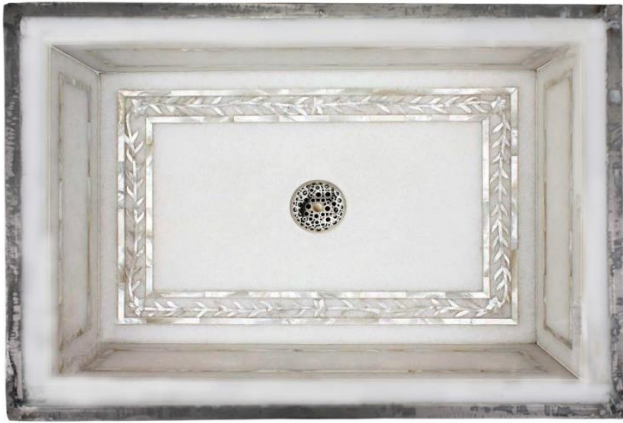
MI10 W shown with D017 PS-SCR02-N drain