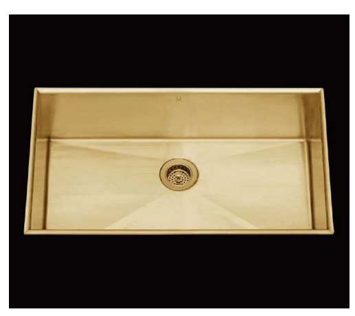
*Flush-Mount Installation Kit is included with each sink *Custom ADA compliant versions are available