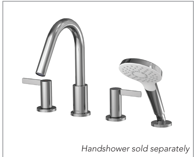
Handshower sold separately